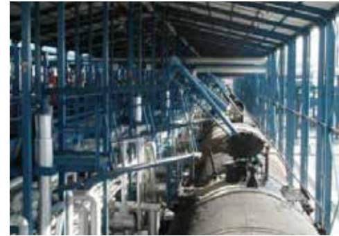
OIL STORAGE AND DISTRIBUTION TERMINALS