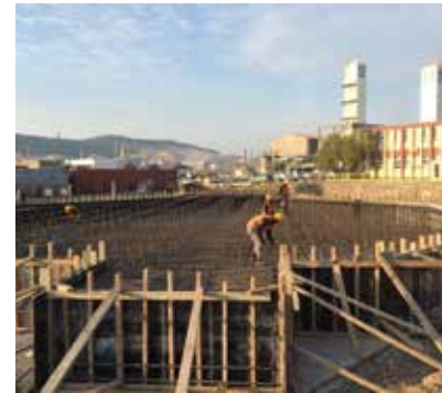
INFRASTRUCTURAL & CIVIL WORKS