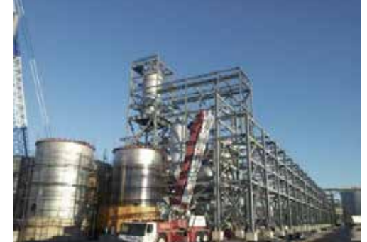
MINE PROCESSING PLANTS