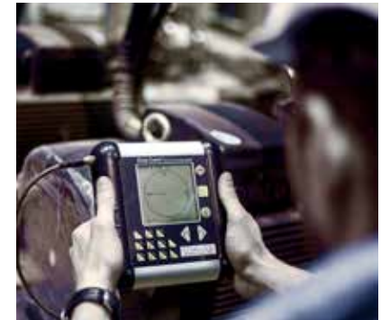
MAINTENANCE AND TURN-AROUNDS