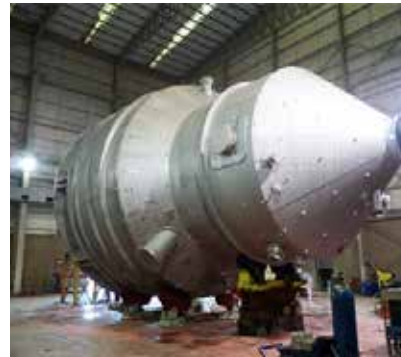
FABRICATION OF PROCESS EQUIPMENT