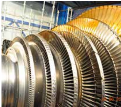
PROCUREMENT AND MATERIAL MANAGEMENT