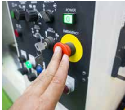
ELECTRICAL & INSTRUMENTATION WORKS