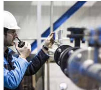
COMMISSIONING & START UP