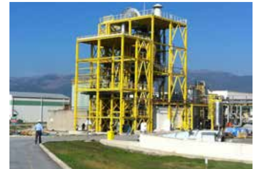
STARCH / GLUCOSE PLANTS