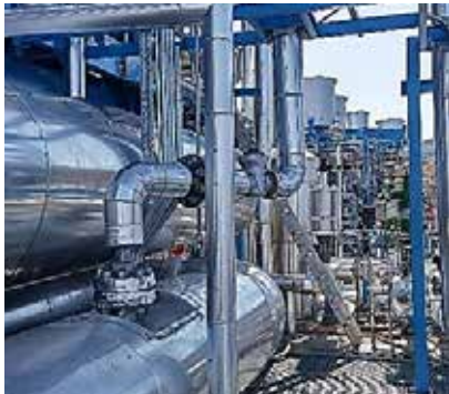
PIPING PRE-FABRICATION & ERECTION