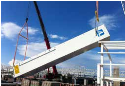
AIR SEPERATION UNITS