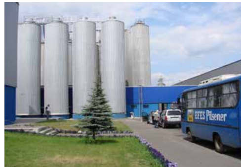
FOOD AND BEVARAGE PLANTS