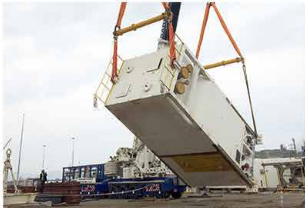
AIR SEPARATION PLANTS