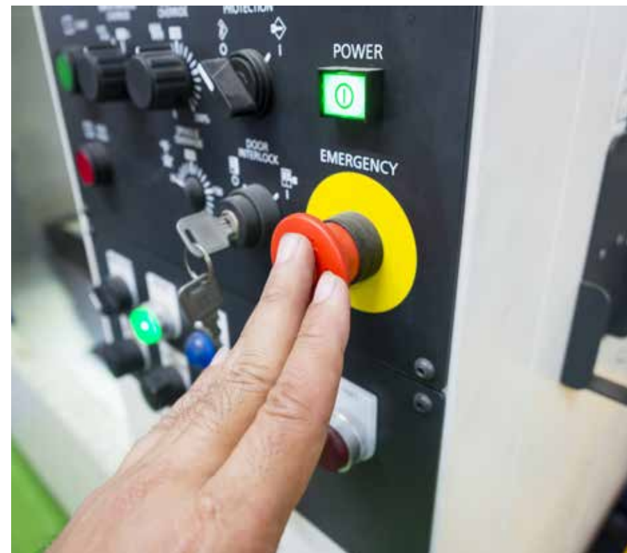
ELECTRICAL & INSTRUMENTATION WORKS