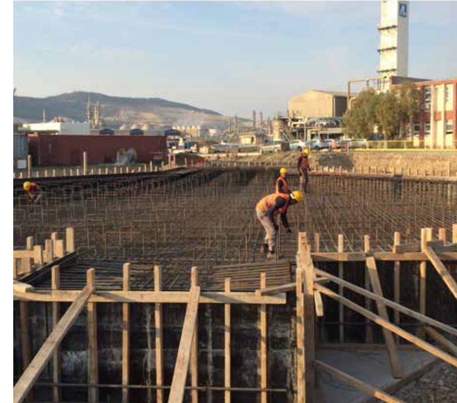
INFRASTRUCTURAL & CIVIL WORKS