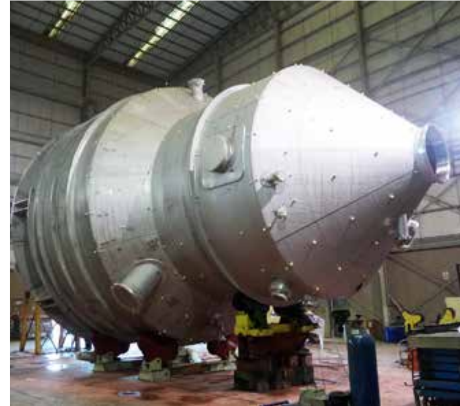
FABRICATION OF PROCESS EQUIPMENT