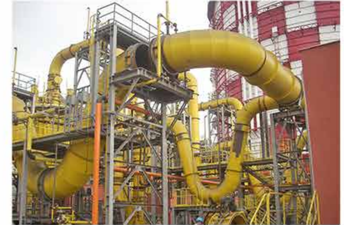
IRON & STEELS PLANTS