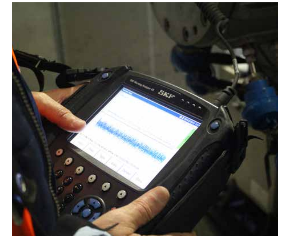
MAINTENANCE AND TURN-AROUNDS