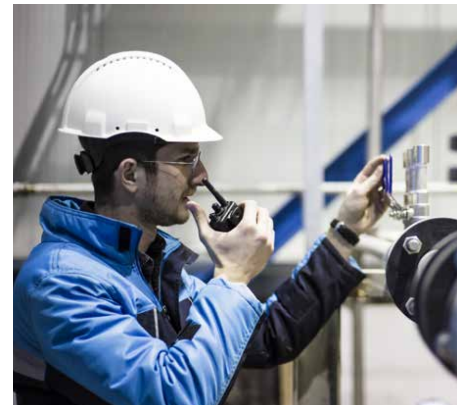
COMMISSIONING & START-UP