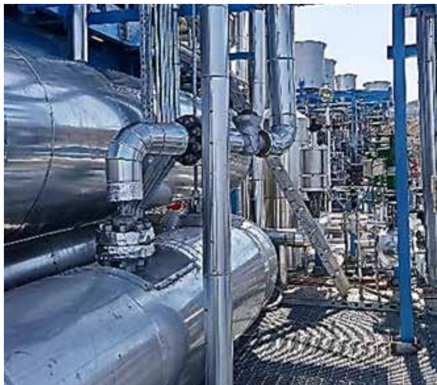
PIPING PRE-FABRICATION & ERECTION