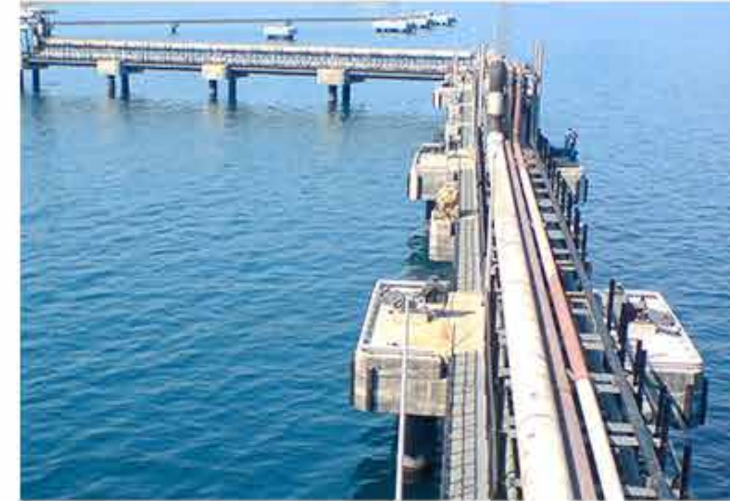
OIL & GAS STORAGE TERMINALS