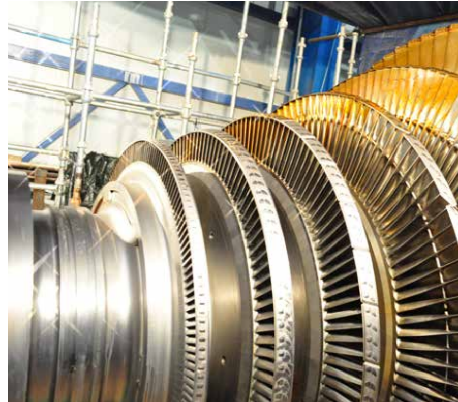
PROCUREMENT AND MATERIAL MANAGEMENT